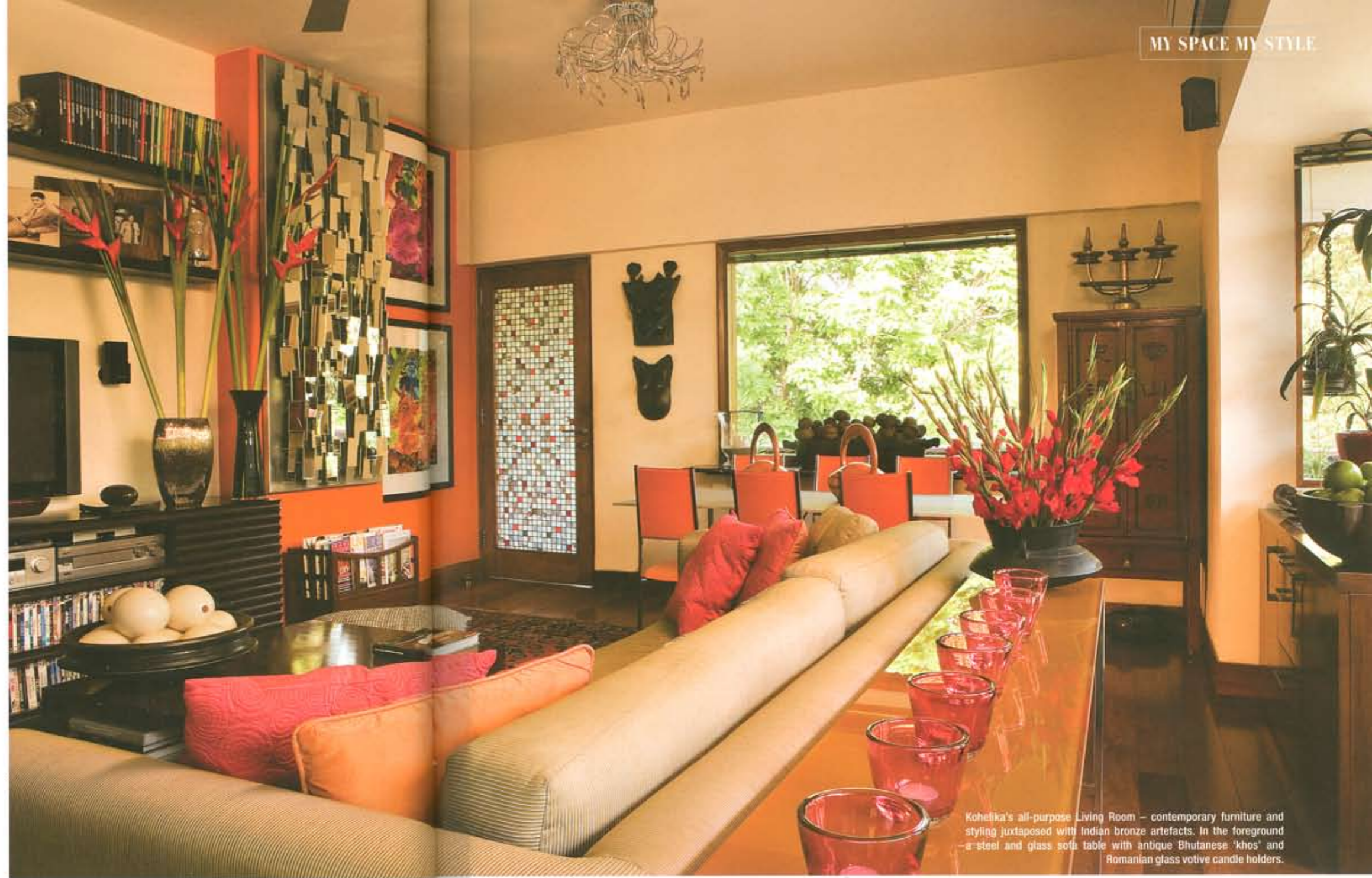
Kohelika's all-purpose Living Room – contemporary furniture and styling juxtaposed with Indian bronze artefacts. In the foreground – a steel and glass sofa table with antique Bhutanese 'khos' and Romanian glass votive candle holders.

Kohelika's one-bedroomed apartment comprises of an all-purpose living room, attached to a small bed-room which is contiguous with an open bath and shower area. Her apartment is vibrant and stylish and very personally adapted to her own requirements. Here contemporary