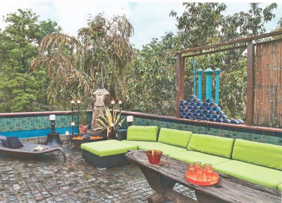
The expansive outdoor area boasts of evergreen plants, cushy and colourful seating, sculptures and accessories. It also offers spectacular views of the Golf Links area. Unwind in style.